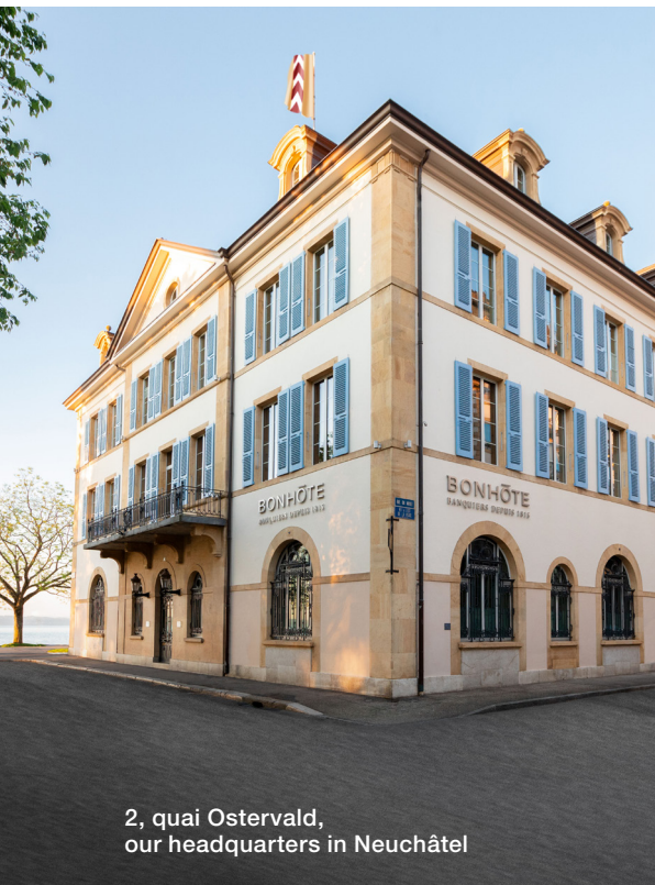
2, quai Ostervald, our headquarters in Neuchâtel

Bank Bonhôte, founded in Neuchâtel in 1815, can look back on a long tradition of expertise in financial and wealth management, its core business. Its size allows the Bank to foster a privileged relationship with each of its clients, based on trust and the quality of its services.